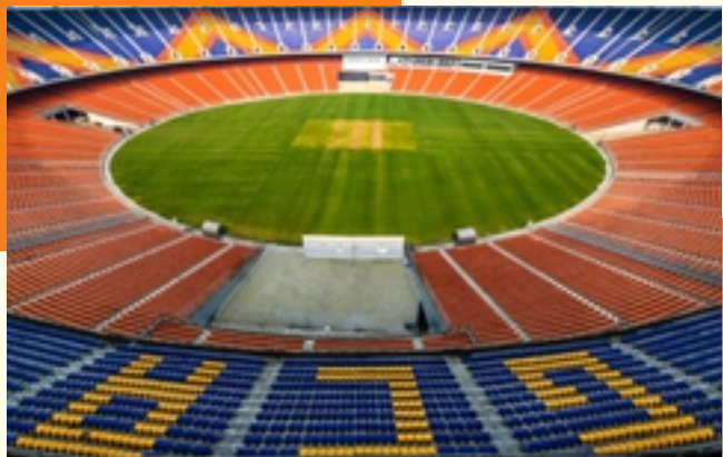
Gujarat Cricket Stadium