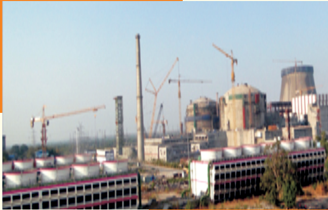
Kakrapar Atomic Power Project High Volume Fly Ash in Nuclear Reactor Dome Construction -Gujarat