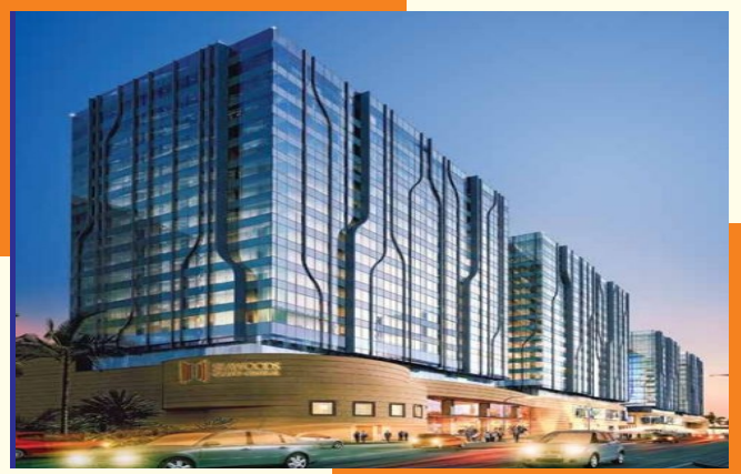
Seawoods Grand Central Tower -Mumbai