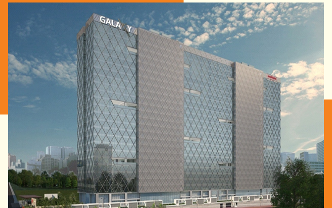
The Galaxy Towers - Hyderabad