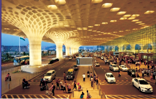
Chhatrapati Shivaji International Airport Project Mumbai