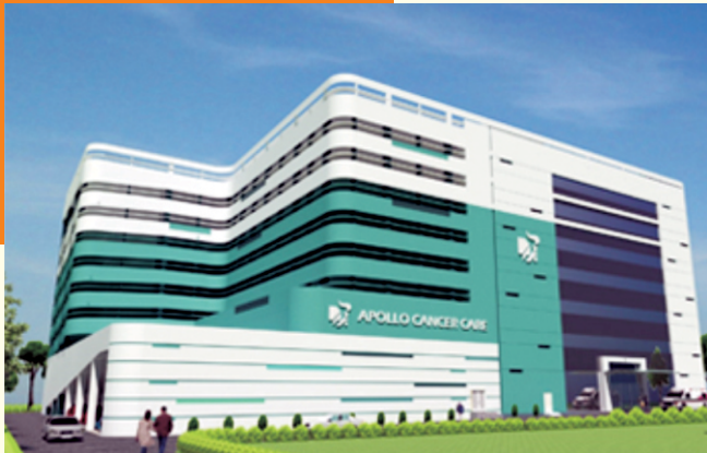
Apollo Proton Therapy and Cancer Care Hospital Project for using Temperature Controlled Concrete -Chennai