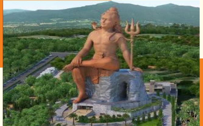
STATUE OF BELIEF -Rajasthan