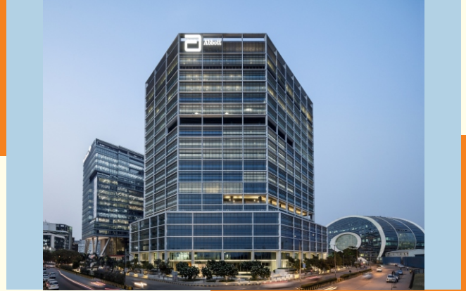
Godrej BKC Project - Mumbai