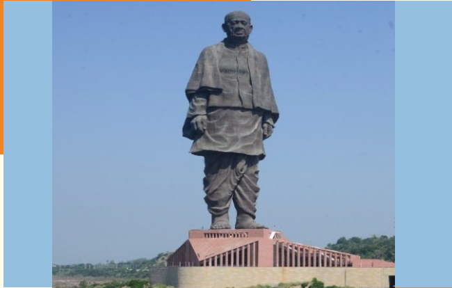
STATUE OF UNITY -Gujarat