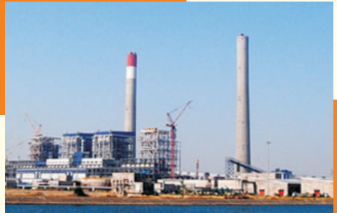
275 m high Chimney at KMPCL Subcritical Thermal Power Plant, Chhattisgarh