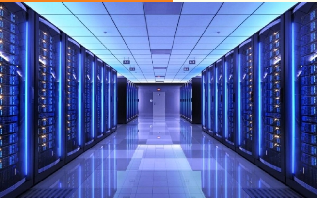
Data Centre - Hyderabad