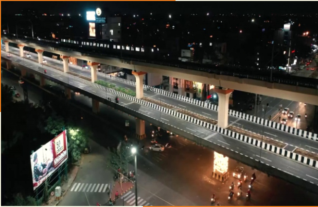
Double Decker Viaduct on Wardha Road-Nagpur