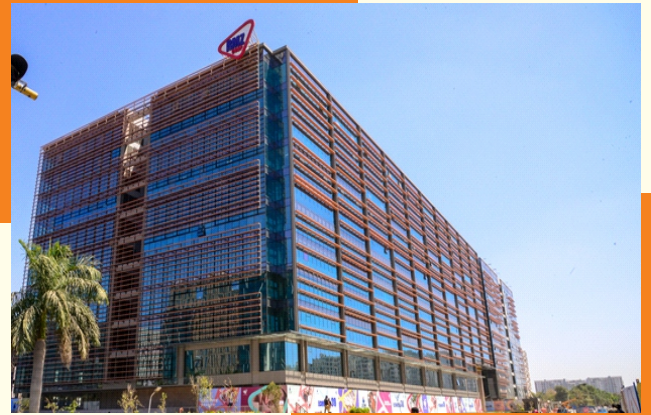
RMZ ECO World Campus, Bengaluru