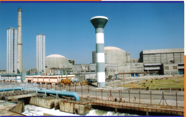
Bhabha Atomic Research Centre - Tarapur