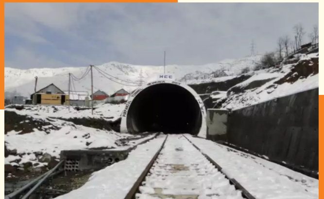
Pir Panjal Railway Tunnel - Jammu & Kashmir